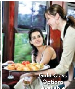
Gold Class Options Available