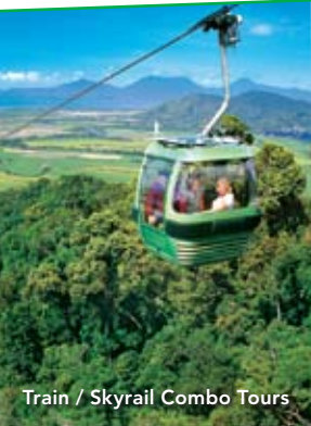
Train / Skyrail Combo Tours