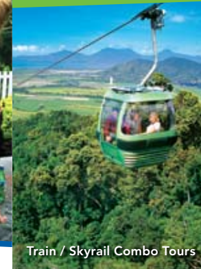
Train / Skyrail Combo Tours