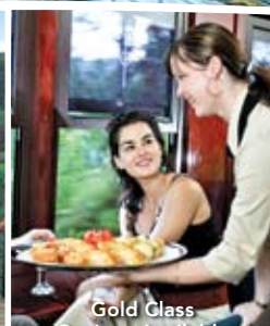
Gold Class Options Available