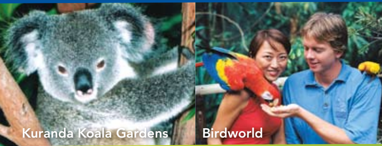
Kuranda Koala Gardens