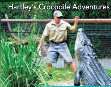
Hartley's Crocodile Adventures