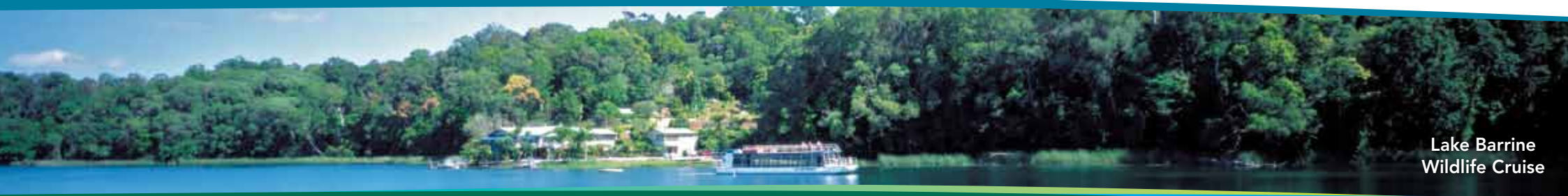
Lake Barrine Wildlife Cruise